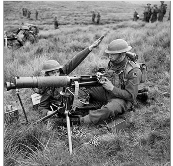
9th Btn. Royal Northumberland Fusiliers training in England. Note the British 18th Division shoulder patch on the gunner.