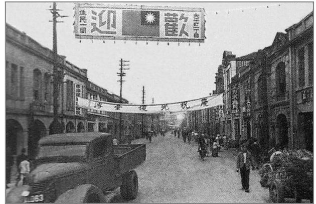
"Victory - The War Is Over" – Celebration banners in downtown Taipei on August 15, 1945.

We hope to welcome many members and friends – and some new faces too. See you in August!