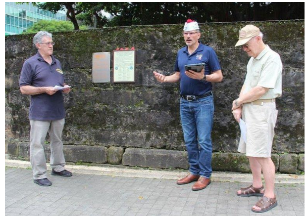
Memorial Day Service – May 30th.