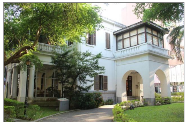
The former American Consulate – now the SPOT Theatre - location for FEPOW Day.

A word regarding donations to the Society: Due to a number of banking changes in Taiwan we are now able to accept donations in British Pounds, Canadian dollars, Australian dollars as well as US dollars. So if making a donation to the Society, please send the funds preferably in a bank wire / transfer to our account here and please contact us in advance for the pertinent account information. Thank you again for your support.