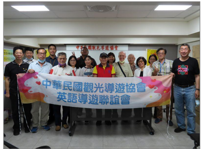
The group after the class.

The first informal class was held on February 24th with about 30 people present. Then again on April 13th the first official class was held at the Tour Guides Association headquarters where about 20 were in attendance. In both classes the guides listened intently and afterward told me that their new-found knowledge will really help them to be able to tell the folks they guide the correct story of the camps, and they were grateful for the opportunity to learn this new information. I was happy to contribute what I could because it is so important that they tell visitors to Taiwan the true story of the camps and the POWs so that more people worldwide will learn it as well.