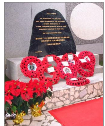
10th Anniversary of the dedication of the Karenko POW Camp Memorial.