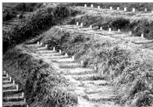
White wooden plaques marked the graves at Kinkaseki Camp.