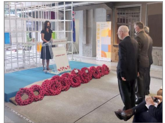
TPCMS, RSL and Anzcham lay a wreath.

Finally the Ode of Remembrance was carried out and the ceremony finished with the Australia and New Zealand national anthems. The service was followed by light refreshments and all those present enjoyed a good time of fellowship. Once again it was wonderful to be able to honour those who have given themselves for our freedom.