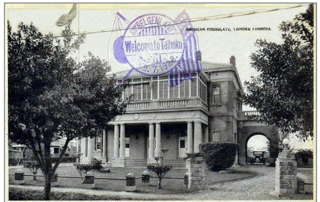
The American Consulate in Taihoku 1928 - Japanese era postcard