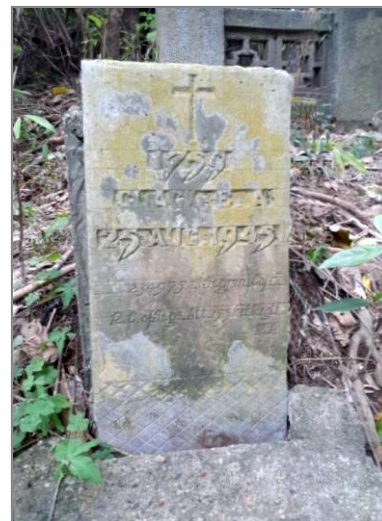
The mystery grave stone at Shokoshihi Cemetery.

I immediately knew who the grave stone belonged to – Signalman Eric A. Clack of the Royal Corps of Signals - one of the six men who died right at the end of the war in August and September, and who had been buried in the old Shokoshihi Cemetery just before all of the other Taiwan POWs were evacuated to safety in the first days of September 1945. I had known about these graves for many years, but was unable to find this elusive cemetery because no-one I had asked knew anything about the cemetery or where it was located. With Huai-Cheng's discovery that mystery had been solved.