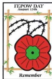
This year's FEPOW Day event features the movie "Merry Christmas Mr. Lawrence" on Saturday August 13th.