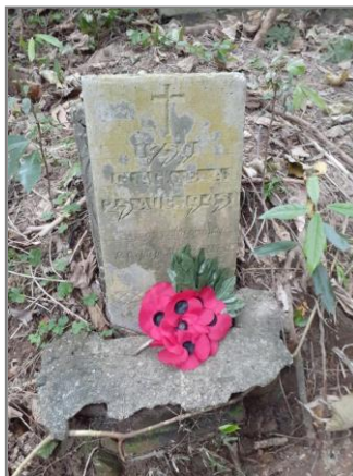
Exploring Taiwan's only concrete POW gravestones.