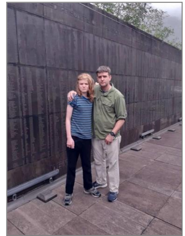
Father and son by the Wall